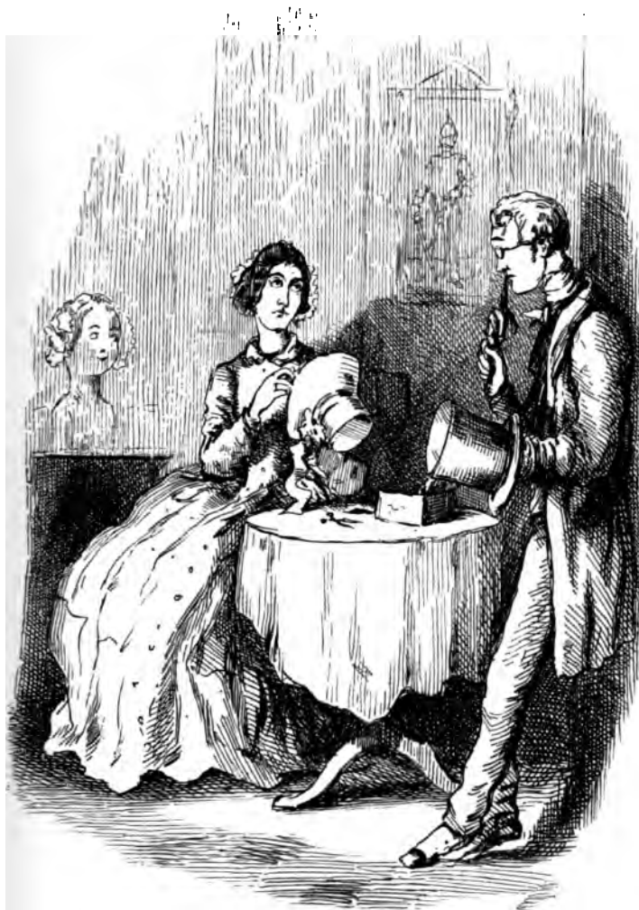
THE CURATE'S CONFIDANTE